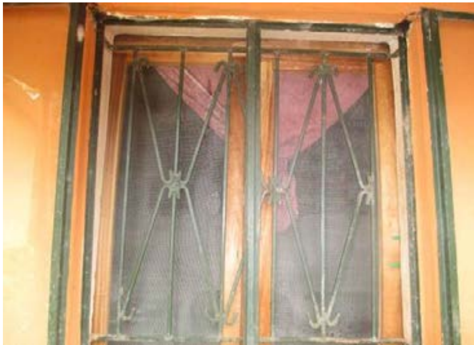
Figure 3. A window with screening on one of the demonstration houses.