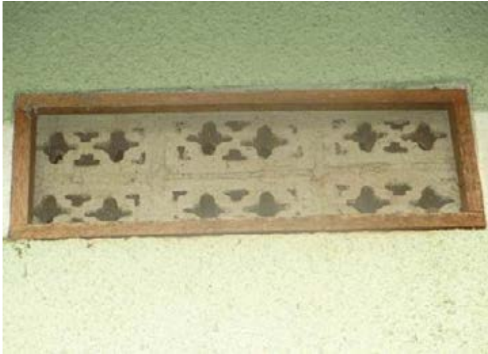
Figure 2. A ventilator with screening on one of the demonstration houses.