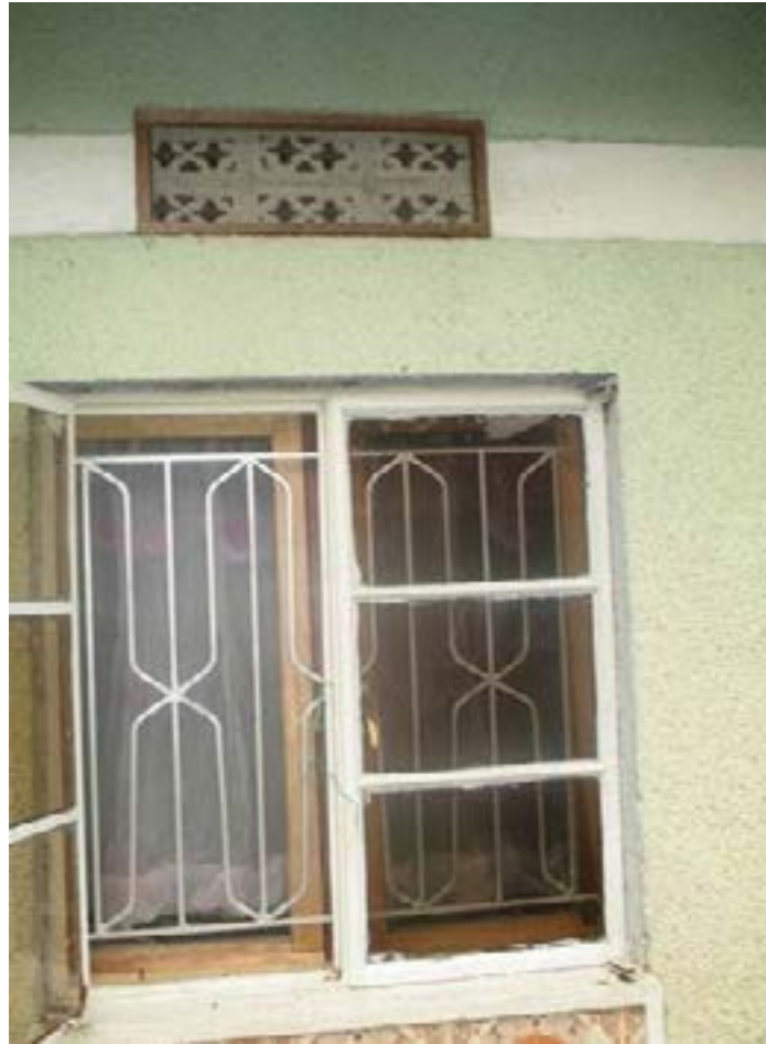
Figure 4. A ventilator and window with screening on one of the demonstration houses.

“Whenever we are treating children in our community, we tell people about various prevention methods that they can embrace in their households to prevent malaria. We tell them that they need to remove all bottles from the compound and slash all overgrown vegetation in the compound. We also encourage them to close the doors and windows early in the evening at around 5.00 pm before the mosquitoes enter the houses because even if you sleep under a mosquito net, the mosquitoes can still bite you when you are in the sitting room watching television. We also tell them to drain all breeding places of mosquitoes and for the permanent ponds, we encourage them to pour oil on top of the stagnant water to kill mosquito larvae. We also advocate use of insecticides like Doom™ to kill mosquitoes.” CHWs FGD, Mayanzi